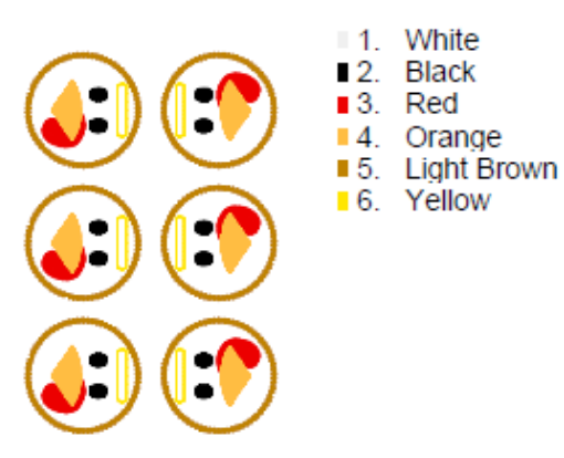
Turkeyboybagtopper Sorted 5x7.pes 103.20x156.40 mm; 10,935 stitches 6 thread changes; 6 colors